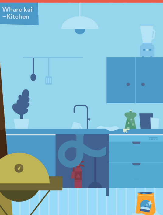
Whare kai -Kitchen