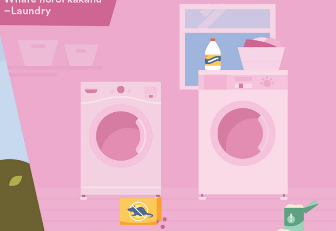
Whare horoi kākahu -Laundry