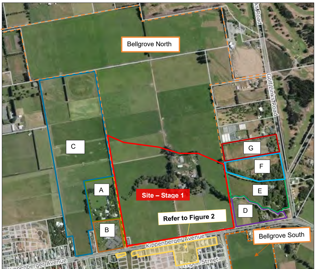
Figure 1. Adjacent Property – Properties A-G

Figure 1 and Figure 2 identify those properties considered to be 'Adjacent' for the purpose of this application. Table 1 contains the corresponding owner and occupier details.